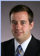
B. Bosch Engineering