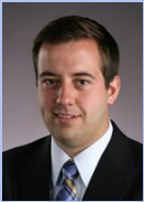
B. Bosch Engineering