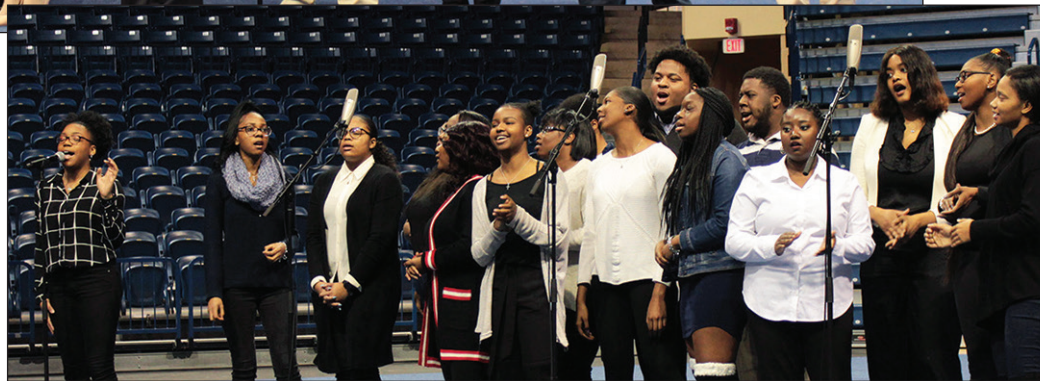
The UT Gospel Choir performed during the Dr. Martin Luther King Jr. Unity Celebration.